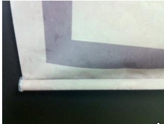
Wavy fabric at bottom rail pictured above ↑