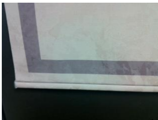
Results of this repair pictured above ↑

Insert a plastic card in between the fabric and the clear plastic Profile in the bottom rail. Slide the card from one side of the rail to the other pushing the fabric back into the rail. Repeat as necessary.